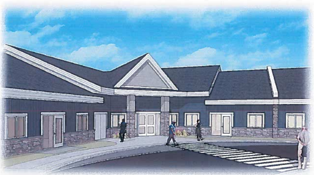
FRONT VIEW LOOKING AT MAIN ENTRANCE