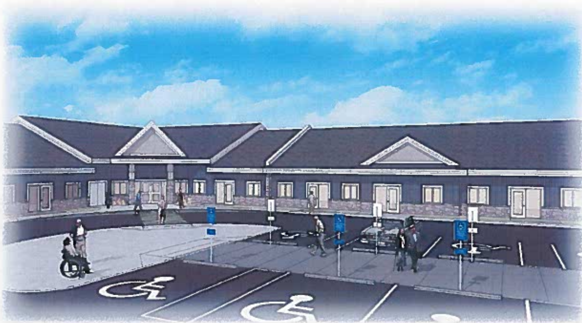
FRONT VIEW FROM PARKING LOT